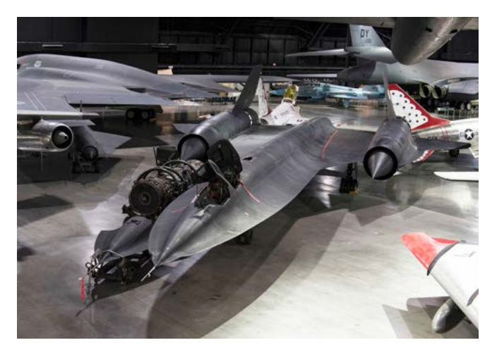
SR-71 BLACKBIRD on display at the National Museum of the US Air Force..

in town. Richardson tells this story in a thorough and engaging way.