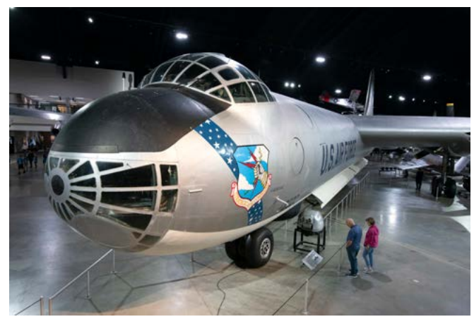
B-36 Peacemaker on display at the National Museum of the US Air Force in Dayton, Ohio.

The advent of World War II changed Gregory's life, as it did so many in the Greatest Generation, and the first third of Spying From the Sky recounts his pilot training and wartime experiences piloting a P-38 Lighting fighter-bomber. Although not directly relevant for those seeking to learn about intelligence collection, this section is nonetheless an exciting and insightful read into the sacrifices of the rapidly fading World War II generation. This material alone makes it an engaging read.