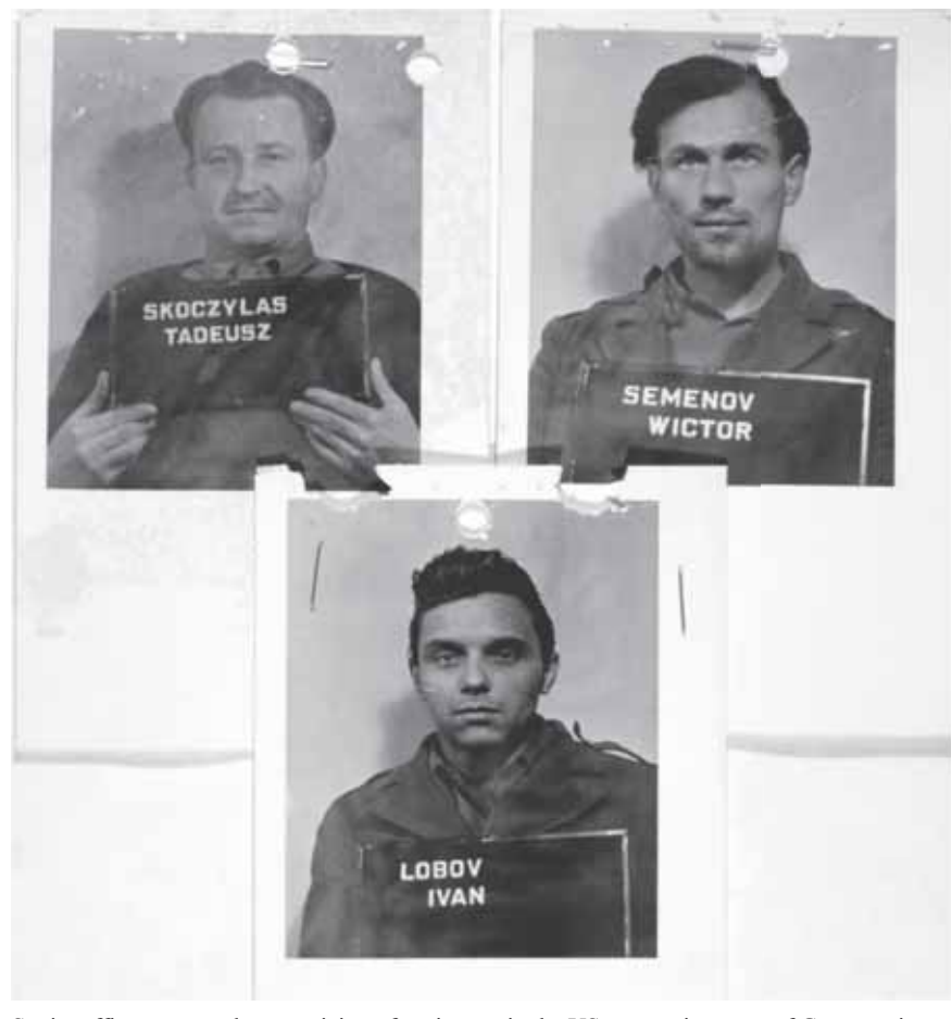
Soviet officers arrested on suspicion of espionage in the US occupation zone of Germany in 1946.

4 July 1945, soldiers of the 2d Armored Division of the US Army entered Berlin, <sup>70</sup> and the city was subsequently divided into four occupation sectors, one for each of the three principal World War II Allies, and France.