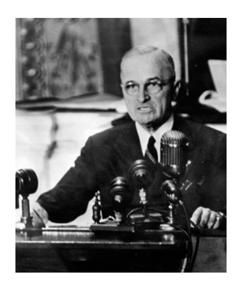
President Truman addressing Congress on 12 March 1947.

The roots of Truman's containment policy are manifold—Stalin's reluctance to withdraw the Red Army from northern Iran, Moscow's support of communist parties