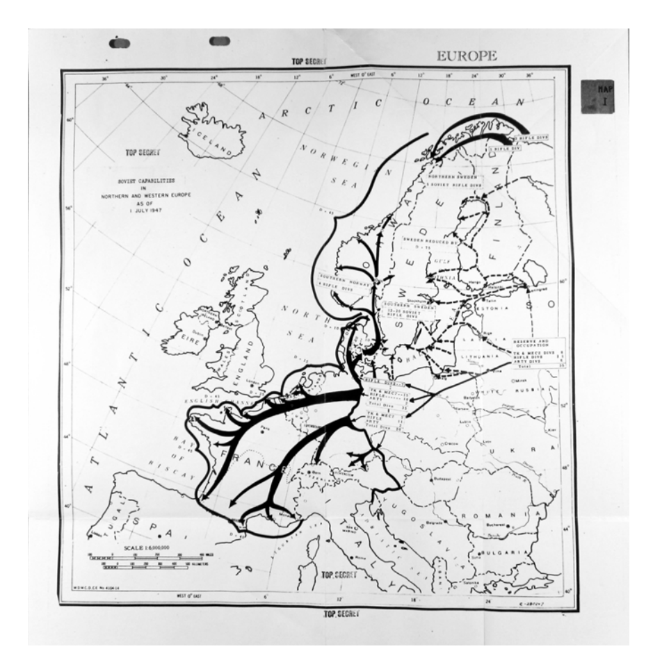
The Soviet threat as seen in 1947. US military intelligence predicted Soviet forces would quickly overrun much of Western Europe in the case of war.

Army intelligence collection and analysis on the Soviet Union reached the highest level of US policymaking. Via his special counsel, Clark