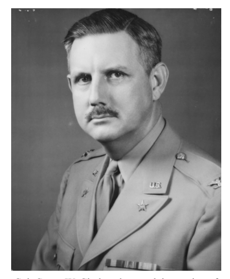
Col. Carter W. Clarke advocated decryption of intercepted Soviet communications during WW II.

Months before the war ended, Army intelligence expressed concern over Moscow's designs on postwar Europe. In January 1945, the Joint Intelligence Committee—to which the Army was a major contributor—produced a detailed "Estimate of Soviet Post-War Capabilities and Intentions." 62 An attempt to forecast Soviet foreign policy