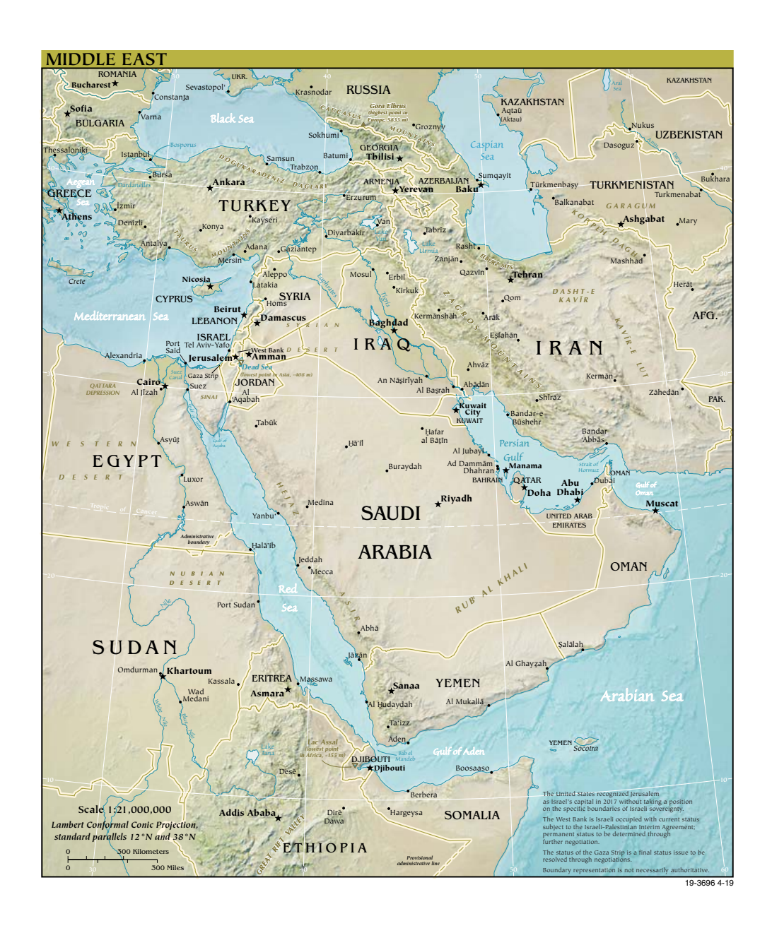
Middle East The World Factbook (CIA, 2019)