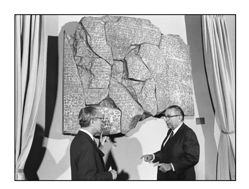
A replica (enlarged) of the Treaty of Kadesh presented in 1970 by the Turkish government to the United Nations. UN Photo by Teddy Chen, 24 September 1970