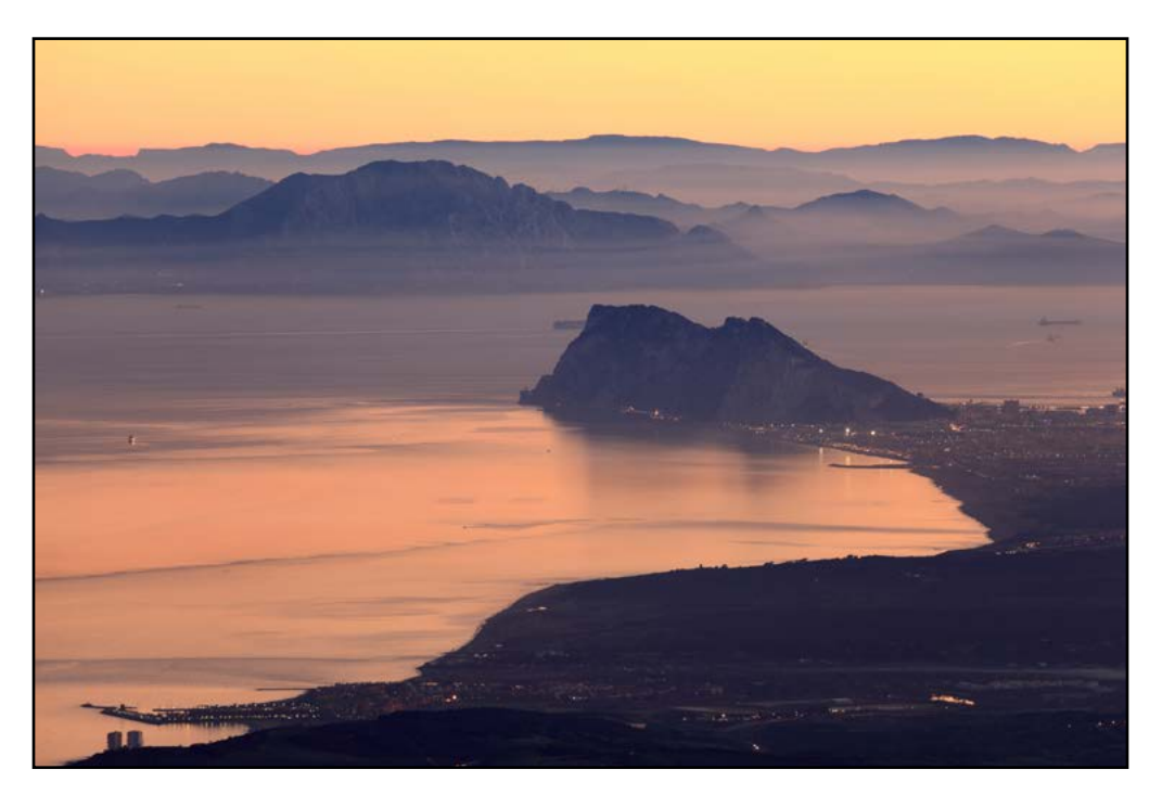
Looking down at the Rock of Gibraltar and the North African coast.