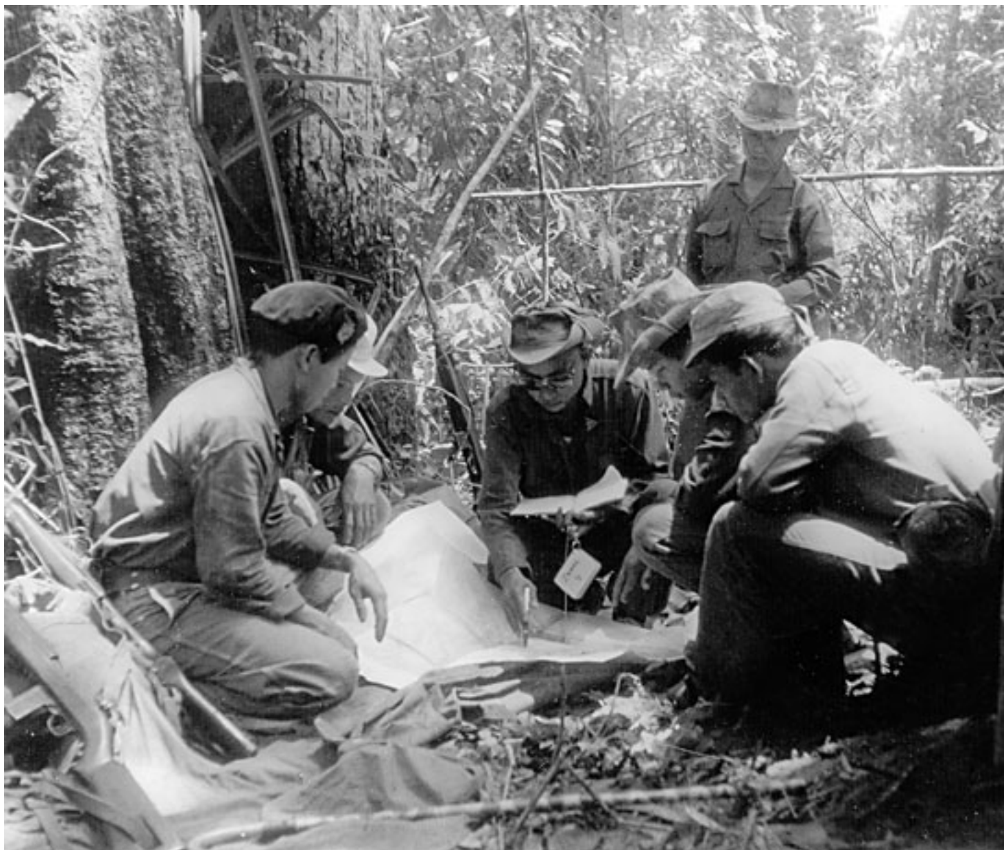
Road-watching team selecting observation site in the eastern Panhandle.

We handed out cameras and trained team members to photograph passing traffic. We also produced laminated plastic cards identifying various kinds of trucks and other vehicles to systematize the reporting terminology.