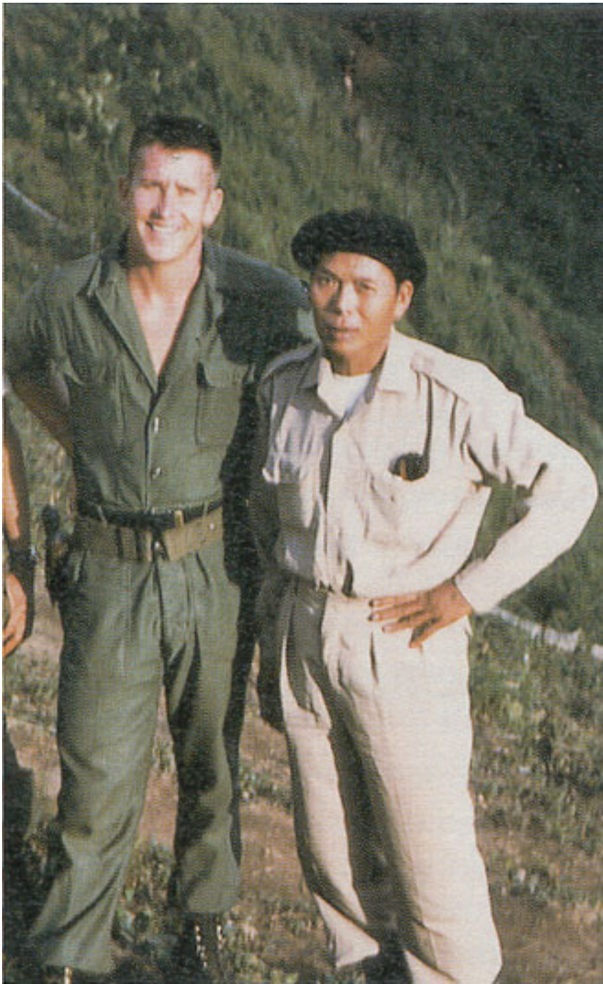
Author at Phou Song, with the Hmong village leader.

Lao politics at the time would have been grist for Shakespeare's mill: a king without power, royal princes working toward conflicting goals, corrupt politicians selling influence and position, and military officers manipulating the system. Mainly because of the infusion of aid funds and supplies coming into Laos, there was a lot of money to be made in Vientiane. Graft and corruption thrived. Working discreetly (sometimes openly) with Lao politicians and military officers, foreign merchants siphoned off huge sums