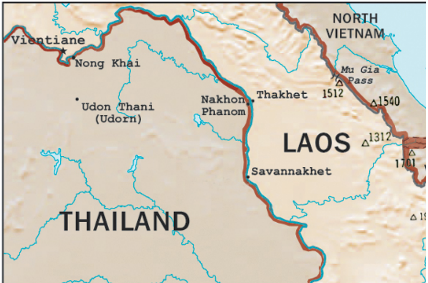
Lao Panhandle, of increasing strategic importance to North Vietnam.

Nakhon Phanom was a quiet, pretty town of several thousand inhabitants. Some streets were paved. A general store, a few small shops, the town's only restaurant, and some government offices were clustered around what appeared to be a central square. My house was near the airport, which had a laterite runway capable of taking large cargo planes. Thai Airways flights arrived twice weekly from Bangkok.