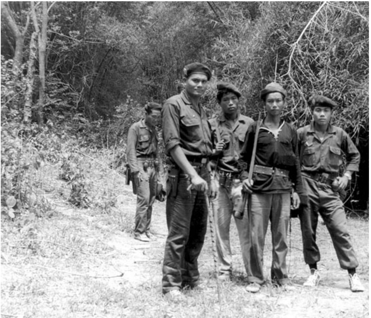
Team leader debriefing patrol returning from the Mu Gia Pass area.