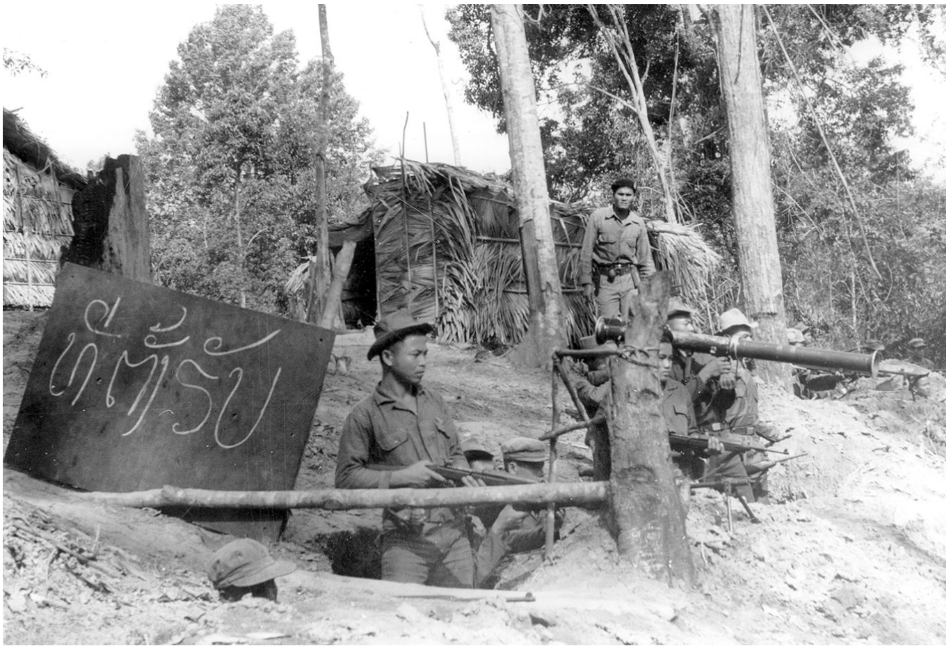
Perimeter outpost at Ban Na.

The second day, Panit showed me the outposts around Ban Na, which formed a semi-circle facing the Plaine des Jarres, an area under the control of the PL and the KL since 1960. Each outpost had mortar and machinegun emplacements and a small shelter in which some 15 Hmong ate and slept. At each stop, we looked at maps while the team leader explained why the particular outpost was placed where it was. Each site afforded a good view of a portion of the western section of the plain. The PDJ is a prominent, and unusual, geographic feature in north Laos. The plateau was so named by the French colonialists because of the enormous, centuries-old earthen jars that are strewn about it. Midway between Vientiane and the border with North Vietnam, the plain covers more than 30 square miles. At that time, the VC had free run of the PDJ and truck convoys from North Vietnam arrived regularly during the dry season bringing all types of supplies for the PL and KL units in the area.