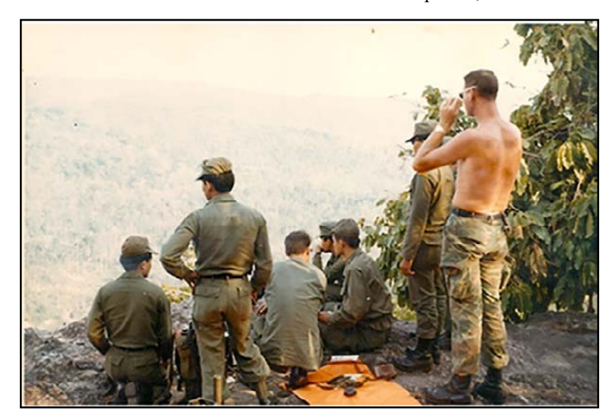
FAG live bombing training with shirtless USAF CCT instructor evaluating his students, ca. 1971.

After classroom training, instructors conducted a live-fire training exercise at the T-28 aircraft bombing range located 20 to 30 miles southwest of Udon Thani RTAFB. The exercise required each guide to direct a US aircraft onto a designated target. A day at the range typically lasted 6 to 8 hours—enough time for the students to practice numerous calls for airstrikes."<sup>27</sup> "We allowed each student to control one aircraft through a half-dozen passes, with bombs and