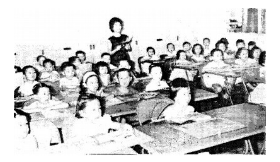
Kindergarten in a Community Center.

In addition, there is a wide range of educational activity carried out at the centers under the supervision of professional instructors. Most centers offer practical instruction for adults in such subjects as reading, languages, sewing, typing, weaving, and painting. There are kindergartens for the children established both as a supplement to the regular educational system and as an answer to the opposition party, which has opened a number of kindergartens of its own.