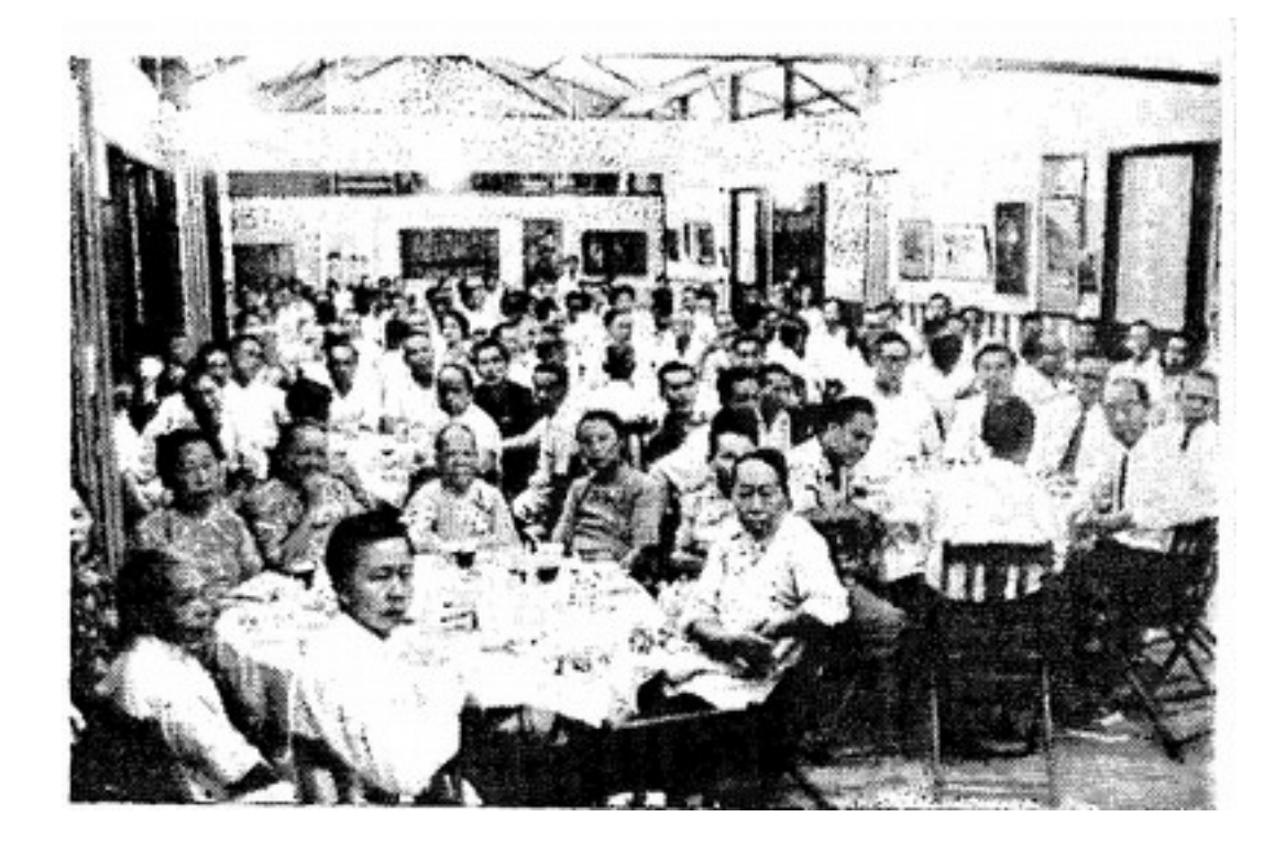
Management Committee Gives Dinner for Neighborhood Leaders.