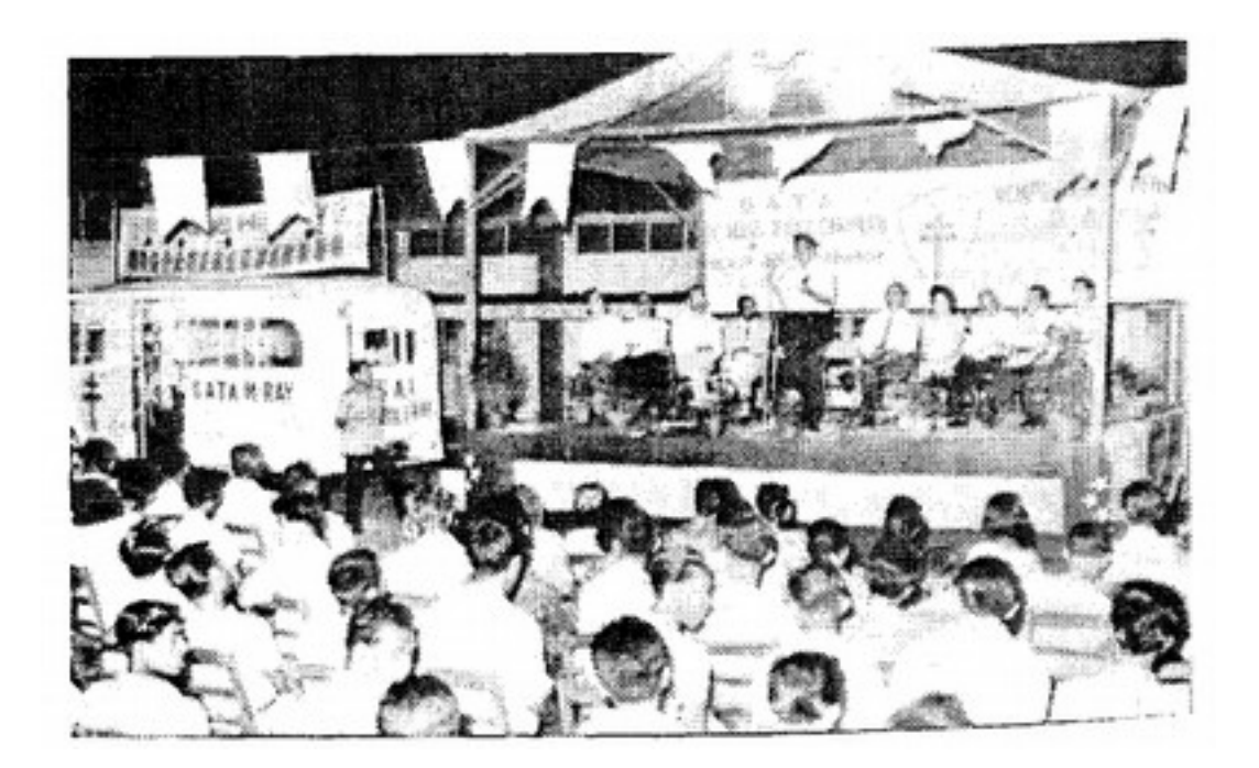
X-Ray Truck at a Community Center.