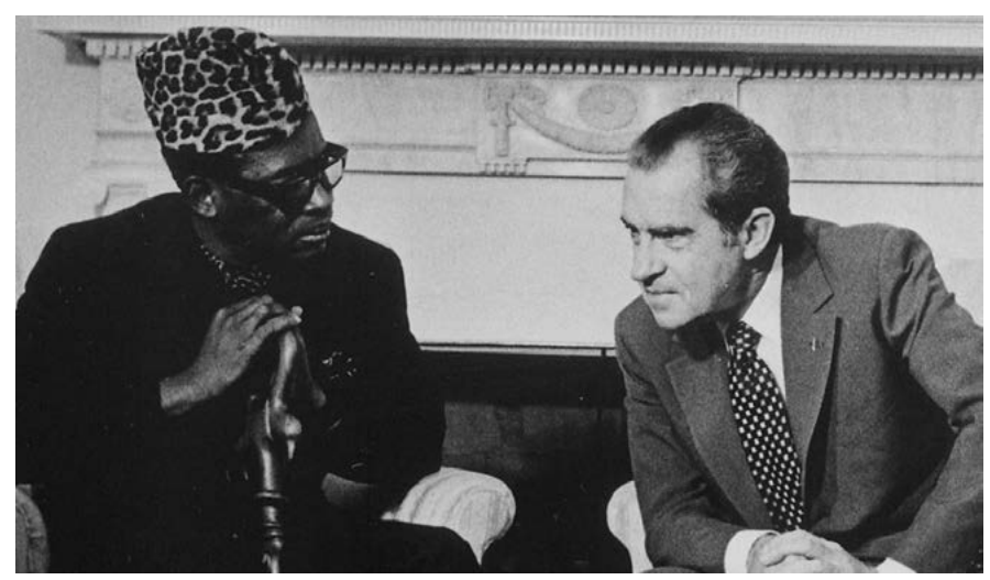
In a PDB prepared for President Nixon (right) on October 10, 1973, the CIA judged that President Mobutu Sese Seko of Zaire (left) had "increasingly engaged in posturing on nonaligned issues" to address criticism that he is too close to Washington.

committed to protecting its friends in the Third World."<sup>15</sup> The most sophisticated pieces raised potential quid pro quos; in 1985, the CIA suggested that in return for more US assistance, Machel may accept a symbolic US naval visit to Maputo, the addition of a defense attaché to the US embassy, and more balanced voting by Maputo's representative at the United Nations. <sup>16</sup>