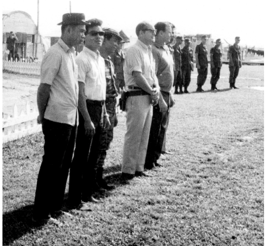
Formal military formations were rare in Tay Ninh. In this case, four members of the PRU were awarded Bronze Stars for bravery during an operation with the US Army's 25th Infantry Division.

While my experience in Tay Ninh does not necessarily represent the experience of other PRU advisers and their units, I can say confidently that the Tay Ninh PRU was successful during my tour. From September 1969 to June 1970, the Tay Ninh PRU