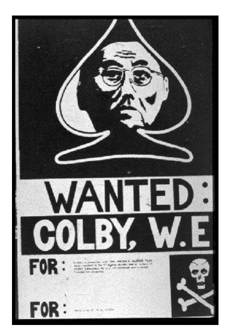
William Colby pictured on a poster attacking the Phoenix program. Date unknown.

The PRUs became probably the most controversial element of Phoenix. They were special para-